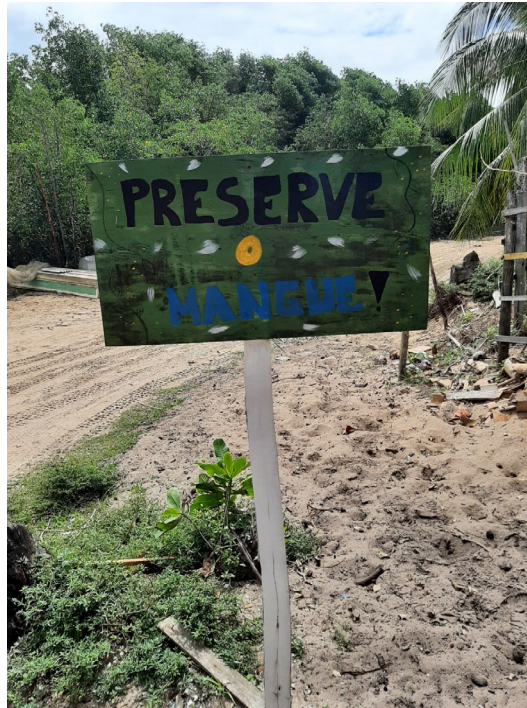
FIGURE 7 In August 2022, one of the still-standing signs. April 2023, sign was gone. Photo: Julia Turska (reproduced under permission – CC-BY-NC).