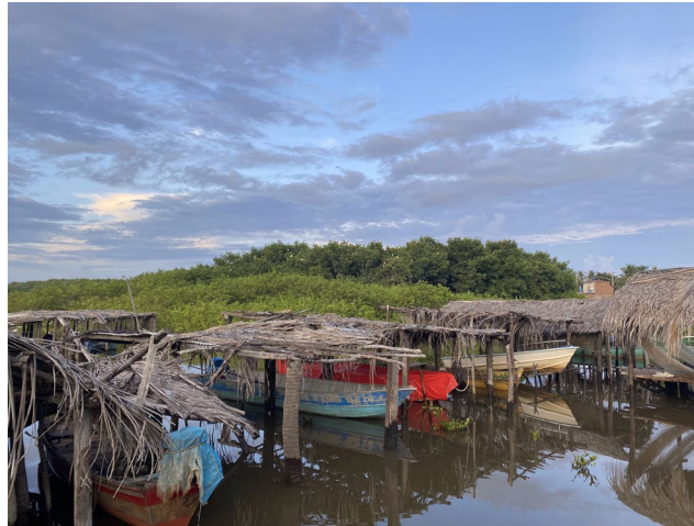
FIGURE 5 Boats used for fishing in the river. March 2022.