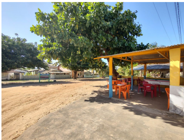
FIGURE 4 Siribinha's main street. Behind the tree, the colourful houses. March 2022.

'Siribinha can be understood as a village at the crossroads where effort and conflict over conservation and development meet' (Milberg et al., 2024, p. 4). The community faces challenges such as silting of rivers, lack of waste management,