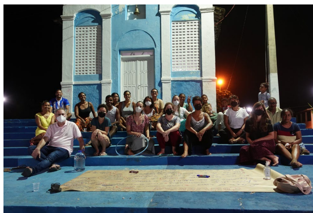
FIGURE 2 Focus group with researchers and community members, February 2022.

Throughout the more-than-human care integrative literature review (Snyder, 2019), preparation for fieldwork, fieldwork, and data analysis, cycles of action and reflection occurred (Cahill, 2007, p. 182)—inspired and informed by PAR