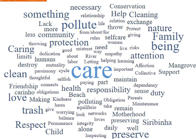
FIGURE 9 Word cloud generated with Atlas.ti based on translated answers from the question: When I say the word care, what comes to mind?