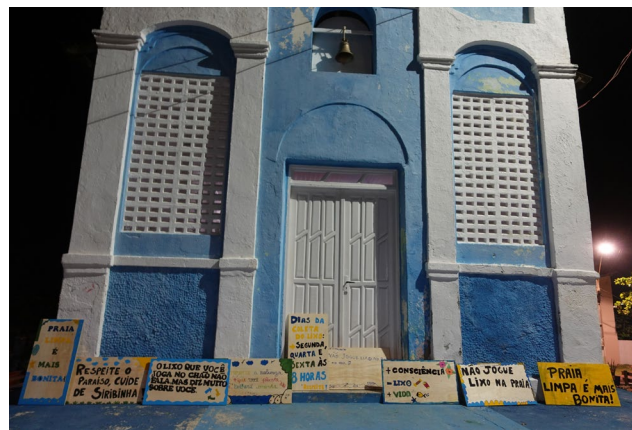
FIGURE 6 Most signs produced during the focus group in March 2022. A total of 11 signs were produced.