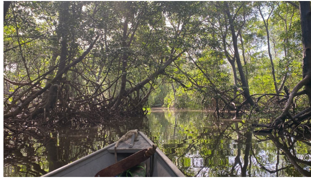
FIGURE 3 Navigating through the mangroves. Community members invited researchers to gather fruits from restinga . (Shrubby thicket-like forests growing on sand dunes) March 2022.