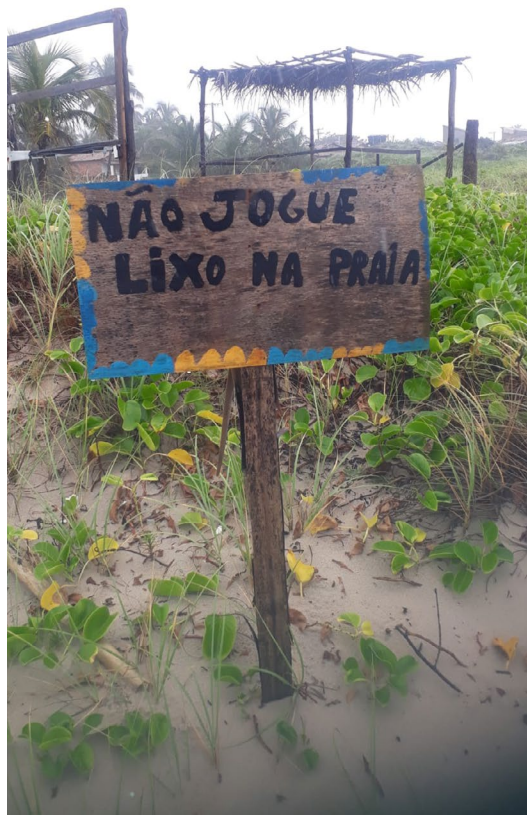
FIGURE 8 One of the three still-standing signs in July 2023.