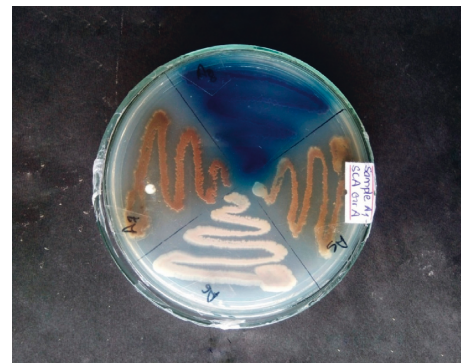
FIGURE 3: Production of pigment by sample A5, A6, A7, and A8 in the SCA medium.

different pigments like green, orange, white, yellow, and brown were extracted from actinomycete isolates and were purified and tested for antimicrobial activity which showed that all extracted pigments inhibited growth of E. coli , Staphylococcus aureus , Bacillus subtilis , and Salmonella typhi except the yellow pigment which showed inhibitory effect against only Gram-negative bacteria [14].