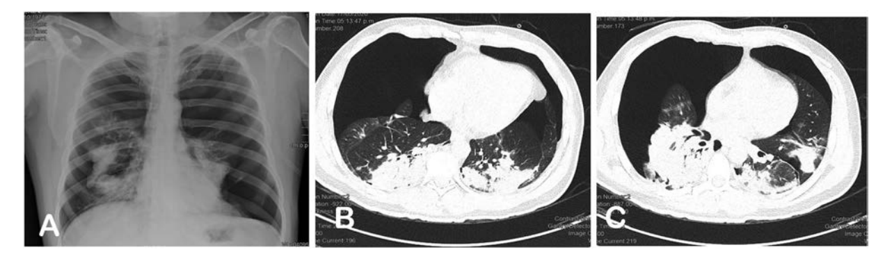
Fig. 1. (A) Chest X-rays at admission reveal bilateral pneumothorax with signs of tension and bilateral lung collapse. (B, C) Chest thoracic computed tomography scan, after chest tube placement in the left hemithorax, shows persistence of pneumothorax and collapse of the right lung and partial resolution of the left pneumothorax with patchy, ground-glass opacities and consolidations.

resolution of the left pneumothorax with ill-defined patchy groundglass opacities and lobar consolidations in the left lower lobe, findings consistent with severe COVID-19 infection (Fig. 1B,C). A right hemithorax chest tube was placed, and the patient was transferred to the COVID area of our Intensive Care Unit (ICU). Laboratory studies at that time were: hemoglobin 15.3 g/L; leukocytes 16,000/µL; lymphocytes 1900/µL; high-sensitivity C-reactive protein 7.17 mg/L (normal range, 1–3 mg/L); ferritin 438 ng/mL (normal range, 23–336 ng/mL); D-dimer 280 mg/mL (normal range, 0–224 mg/mL); troponin I 8.3 ng/mL (normal range, 0.10–0.16 ng/mL); NT-proBNP 104 pg/mL