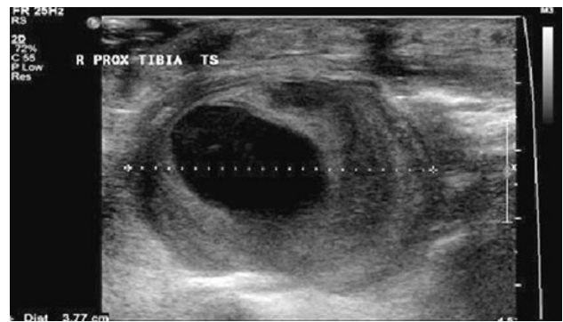
Fig. 2 Ultrasound scan around the pin sites revealing a large mass with turbulent flow, suspicious of a pseudoaneurysm

One-month after the procedure, the regenerate was seen to consolidate further with a decrease in the concavity of the scalloping (Fig. 3). The fixator was removed 8 months postoperatively. Further radiographs 1-year postoperatively showed a fully healed corticotomy site with filling-in of the defect (Fig. 4).