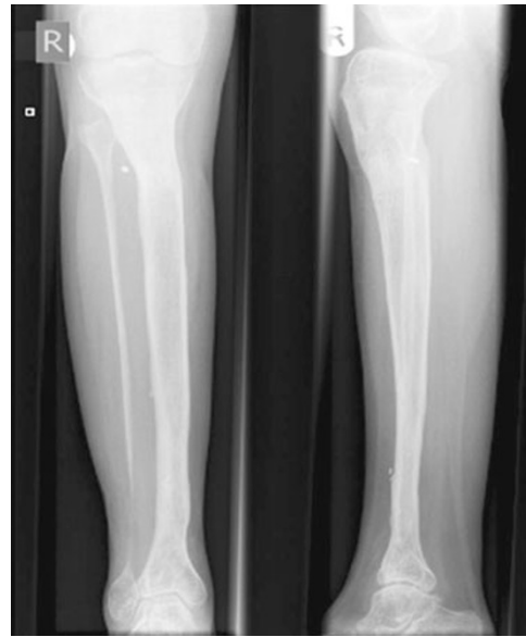
Fig. 4 Plain radiographs at 1-year follow-up showing a fully healed corticotomy site with filling-in of the previous scalloping

osteotomy, but the ultrasound appearances suggested a neck related to a wire site. Previous surgery being performed in the same region probably increases the chance of arterial injury. This is due to the presence of scar tissue preventing normal vessel mobility, already limited in this case by the tethering of the anterior tibial artery to the interosseous membrane. This makes intraoperative injury