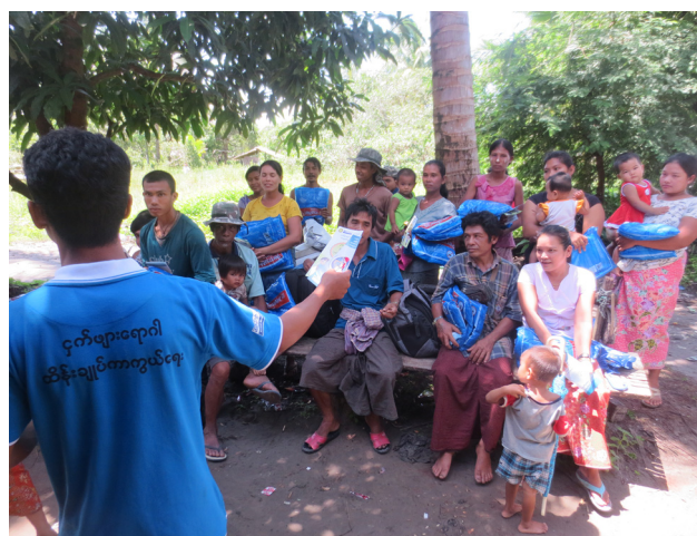
A village malaria worker provides health education to community members in Htaung Phee village in Bokpyin Township, Tanintharyi Region of Myanmar.

The use of VMWs requires a strong monitoring and supervision component to ensure quality of uninterrupted services by VMWs in the community. Operational costs are lower when the monitoring and supervision is integrated into local health systems and rural health staff are engaged