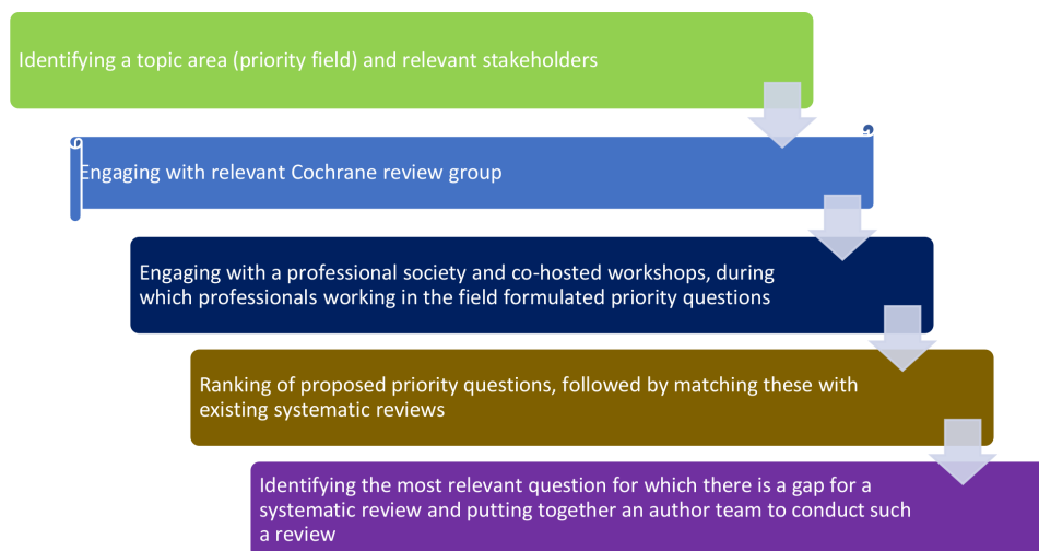
Figure 3 Priority setting process in the Southern-Eastern hub.