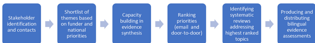
Figure 2 Priority setting process in Francophone hub.

In the West African hub, a combination of methods, including a modified Delphi process and some of those identified by the Cochrane priority setting methods group, 15 were used in an iterative way. The Delphi process involved two rounds of prioritisation where key stakeholders in the first round indicated top priorities via email and in the second round, were asked to add to the list just before stakeholder discussions. The Cochrane methods group identifies authors of systematic reviews as stakeholders in the process hence our decision to involve them. Electronic and face-to-face contacts with key informants were done at various stages of the process across four countries namely Nigeria, Liberia, Ghana and Sierra Leone. The stakeholders were selected based on their involvement with Cochrane activities in