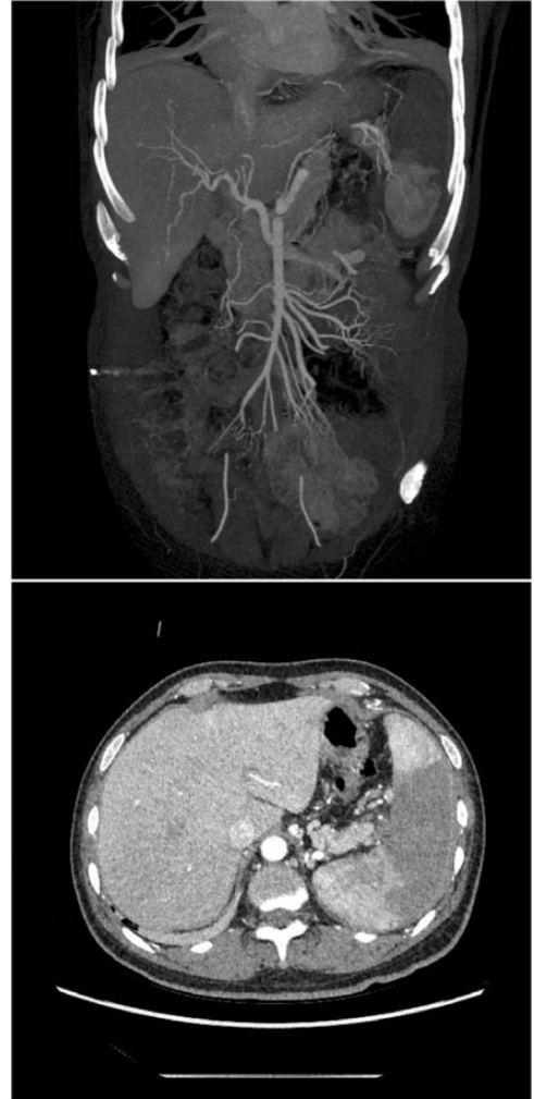
Figure 2. Representative enhanced computed tomography images of the abdomen in a 45-year old male patient diagnosed with splenic infarction caused by secondary erythrocytosis associated with obstructive sleep apnoea/hypopnoea syndrome. Images show single wedge or irregular low-density lesions in the spleen, with the base at the outer edge of the spleen and the tip pointing to the splenic hilum (upper image, coronal scan of spleen; lower image, axial scan of spleen).

spleen, with the base at the outer edge of the spleen and the tip pointing to the splenic hilum. The boundary was clear or fuzzy, and the lesion was not strengthened after