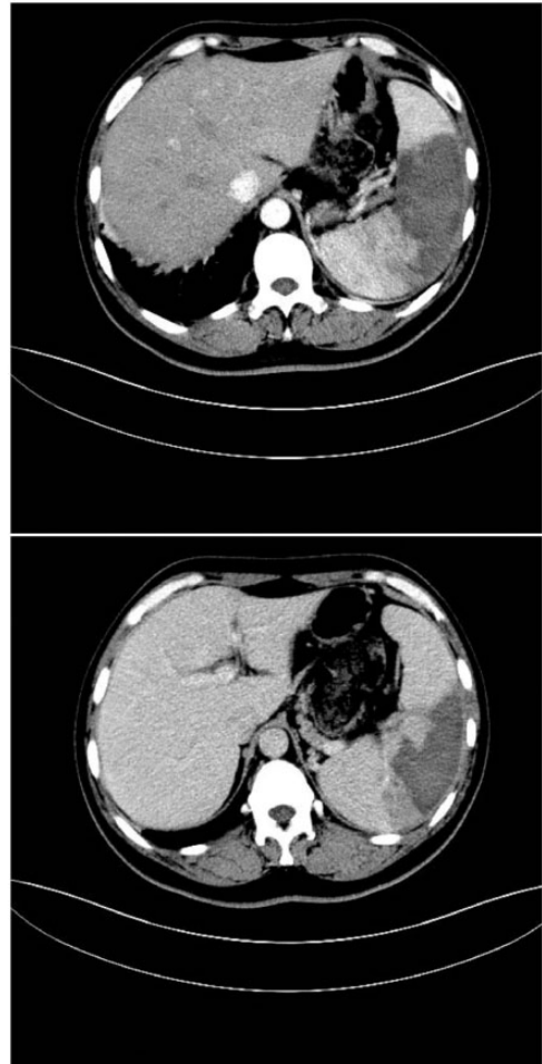
Figure 3. Representative enhanced computed tomography images of the abdomen in a 45-year old male patient diagnosed with splenic infarction caused by secondary erythrocytosis associated with obstructive sleep apnoea/hypopnoea syndrome. Images show improvement of splenic infarction and a reduction in the splenic infarction area after 10 days of treatment (upper image, arterial phase scan of spleen; lower image, venous phase scan of spleen).

Embolization may occur in noncommunicating end-artery branches of the splenic artery, due to multiple factors mainly related to intra-splenic thrombosis, arteriosclerosis, embolism, microvascular embolization, and ectopic embolus detachment in infective endocarditis. 6 Any disease that causes increased blood viscosity can lead to limited tissue perfusion, ischaemia and thrombosis, 1,2 and OSAHS has been associated with a variety of cardiovascular, cerebrovascular and thrombosis-related diseases. 4,5 OSAHS provides the three elements of Virchow's triad that are necessary for thrombosis, namely vascular endothelial damage, venous blood stasis and hypercoagulability. Hypoxaemia and hypercapnia are caused by intermittent hypoxia due to apnoea in patients with OSAHS, which