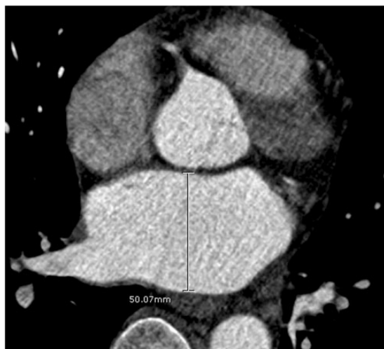
Fig. 1. A 57-year-old man with AF. Pulmonary vein CT from pre-ablation mapping shows measurement of the left atrium in AP diameter. The largest diameter in the AP dimension was chosen.