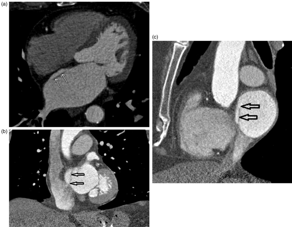
Fig. 4. A 66-year-old woman with AF. Pulmonary vein CT for pre-ablation mapping demonstrates a LA septal pouch at the fossa ovalis, a typical location (double arrows) in (a) axial, (b) coronal, and (c) sagittal views.

is as high as 25% on TEE (18) and 22.6% on cardiac CT (18,19). Investigators have used different imaging criteria to diagnose PFO. Williamson et al. created three CT criteria to establish PFO: (i) presence of LA septal pouch at the location of septum primum; (ii) visualization of the contrast column between septum primum and septum secundum; and (iii) visualization of the contrast jet from left atrium into the right atrium (20). By using visualization of contrast jet across the two atria (from the left atrium to the right atrium) as a stringent criterion, the prevalence is relatively low. Kim et al. found 2.1% in his series (21) while Purvis et al. found 4.6% (22).