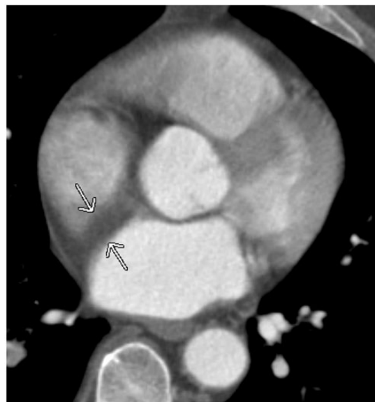
Fig. 6. A 59-year-old man with AF. Pulmonary vein CT for pre-ablation mapping shows a prominent fat deposition in the interatrial septum (arrow), corresponding to LHIS.

The coronary sinus (CS) receives deoxygenated blood from the anterior and posterior interventricular veins, the great cardiac vein, and the left marginal and posterior veins draining into the right atrium. Absence of a coronary sinus roof, unroofed coronary sinus, is a rare cardiac abnormality defined as a communication