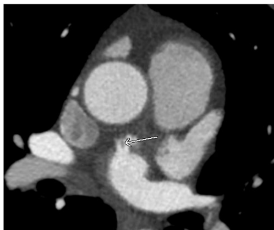
Fig. 2. A 56-year-old woman with AF. Pulmonary vein CT for pre-ablation mapping shows a small LA diverticulum with a pectinate muscle (arrow) continuing with the extension of LAA.

The prevalence of LA diverticulum in our patients, 33% in AF patients and 23% in NSR patients, was similar to the recent studies by Troupis (12) and Lazaura (13) (23.5–40% in AF patients and 20.5–36% in NSR patients) but the prevalence of LAA diverticulum in our study (8.8% in AF group and 11% in NSR group) was slightly higher than reported by Lazaura (13) (6.5% in both AF and NSR groups). Although with a slight difference in the prevalence, no statistical significance of prevalence of LA and LAA diverticulum was demonstrated between AF and NSR patients in our series.