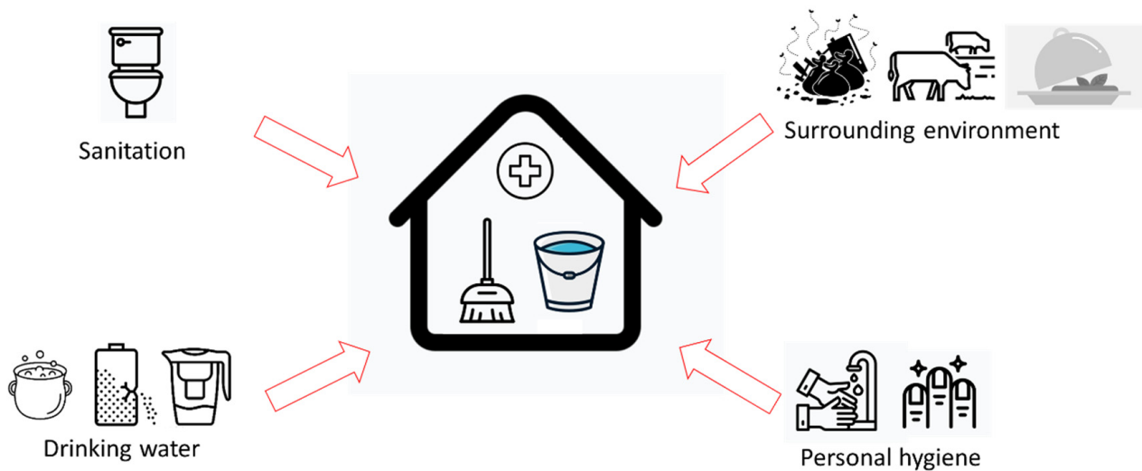
Figure 2. The conceptual model of four clusters of the determinants of household hygiene.

A variable toilet facility is related to sanitation. There are six variables related to the surrounding environment: “livestock nearby”, “floor types”, “floor cleanliness”, “feces around”, “garbage around”, “flies around”, and “food storage”. The next cluster is drinking water, which consists of variables measuring the water storage conditions (cover, crack, placement, and cleanliness), whether they practice household water treatment or not, and this was complemented with drinking water quality, i.e., whether E. coli was detected or not. Finally, the last cluster concerns personal hygiene, i.e., related to fingers, which comprises the presence of handwashing facilities and the condition of respondent’s nails. This study assumes that those variables represent general household hygiene conditions.