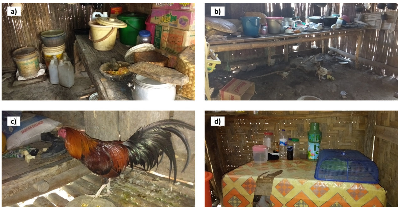
Figure 3. Examples of observable household hygiene conditions in the study area: (a) drinking water is stored in a jerry can or a bucket; (b) earthen or not permanent kitchen floor and chicken inside the kitchen; (c) dirty bamboo kitchen floor with chicken’s feces; (d) food is stored inside of the food cover.

Most of the respondents were a mother (84.5%), while others were the father or household head. The proportion of households with and without children under the age of 5 was almost equal, i.e., 47.8% and 52.2%, respectively. The mean schooling time of the mother was 7.7 years (SD = 3.6), while that of the household head or father was 7.4 (SD = 3.6). About one-fourth of the respondents (26.3%) practiced the local belief “Marapu”. The mean spare time of the respondents was 2.9 h in a day (SD = 2.1). In terms of the accessibility of the location of the respondent’s house, about 54% of the respondents were located in an area where it was relatively difficult to access the market. The majority of the respondents had a non-permanent wall (87.8%), e.g., bamboo or wood, and a non-permanent floor (72.3%), e.g., bamboo, earthen, or compacted soil, while only 7.9% had a non-permanent roof, e.g., straw. Having livestock was common, i.e., 89.9% of respondents had at least one pig, and 25.5% had a cow(s). A total of 78.8% of households were observed to cover their food. Figure 3 shows examples of the house kitchen conditions in the study area.