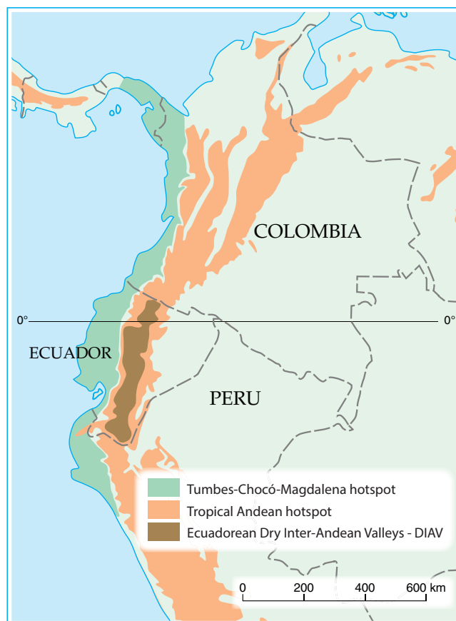
Figure 1 Map of northern South America with hotspot areas: Tropical Andes and Tumbes-Chocó-Darién. Full-size DOI: 10.7717/peerj.6207/fig-1

been viewed as incompatible. Much threatened biodiversity lives in agricultural areas, but the trade-offs between biodiversity and farming exist and depend on shared landscape methods (Mehrabi, Ellis & Ramankutty, 2018). These areas, if extensively managed for food production could support high levels of biodiversity (Durán, Duffy & Gaston, 2014). Thus, failure to consider agricultural areas would leave many species unprotected including some falling within protected areas. This reality does not apply only to the western world but is important also in developing countries. It is important to identify adequate land-management techniques to promote conservation in countries like Ecuador (Wright, Lake & Dolman, 2012).