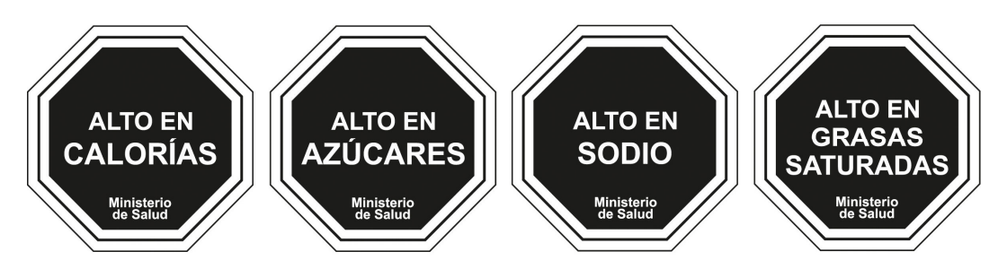
Figure 2. Example of a front-of-package (FoP) nutrient warning label system from Chile. In English, the labels say, "high in calories," "high in sugars," "high in sodium," and "high in saturated fats," respectively, with "Ministry of Health" noted at the bottom.

A nutrient warning was defined as a label that conveys information that a product contains high or excess levels of specific nutrients (sugar, saturated fat, sodium, or energy) or any amount of other nutrients of concern (trans fat or non-caloric sweetener) (Figure 2). Studies that examined only other types of FoP labels, such as health warnings (images/and or text statements linking consumption of a product to a health outcome), Guideline Daily Amounts (GDAs), positive logos, traffic light labels, Nutri-score, or the Health Stars Rating System were not included. We included only studies that focused on labels on the front of food and beverage packages; studies that focused only on labels on menus, store shelves, vending machines, advertisements, or in cafeterias were excluded. We included studies with any or no control (i.e., eligible studies compared nutrient-based warnings to other nutrient warnings, a no warning control, other FoP labeling systems, or other controls).