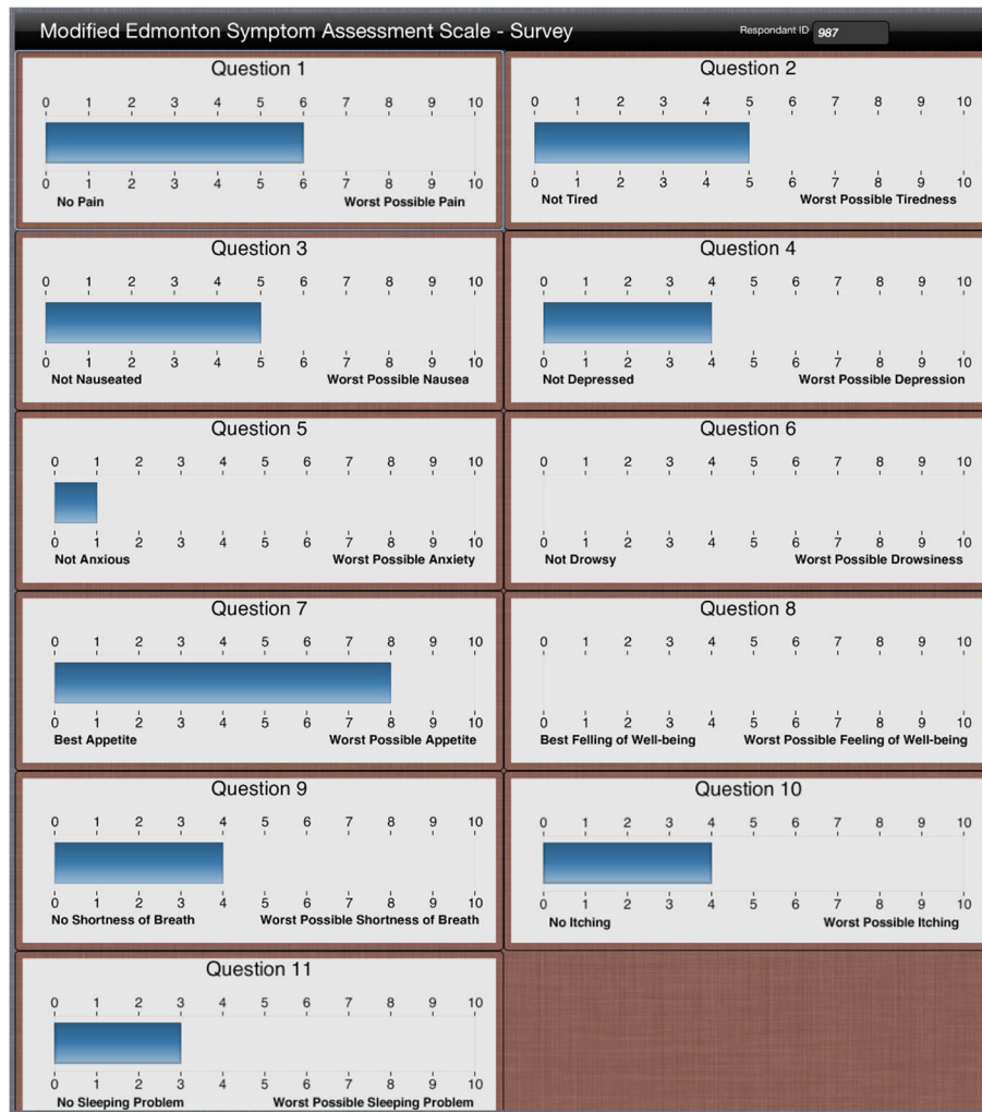
Fig. 1 Example of Edmonton Symptom Assessment System renal (ESAS-r:Renal)App Results Display