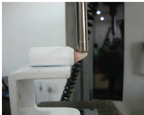
Figure 2: Specimens subjected to bond strength testing in a universal testing machine.