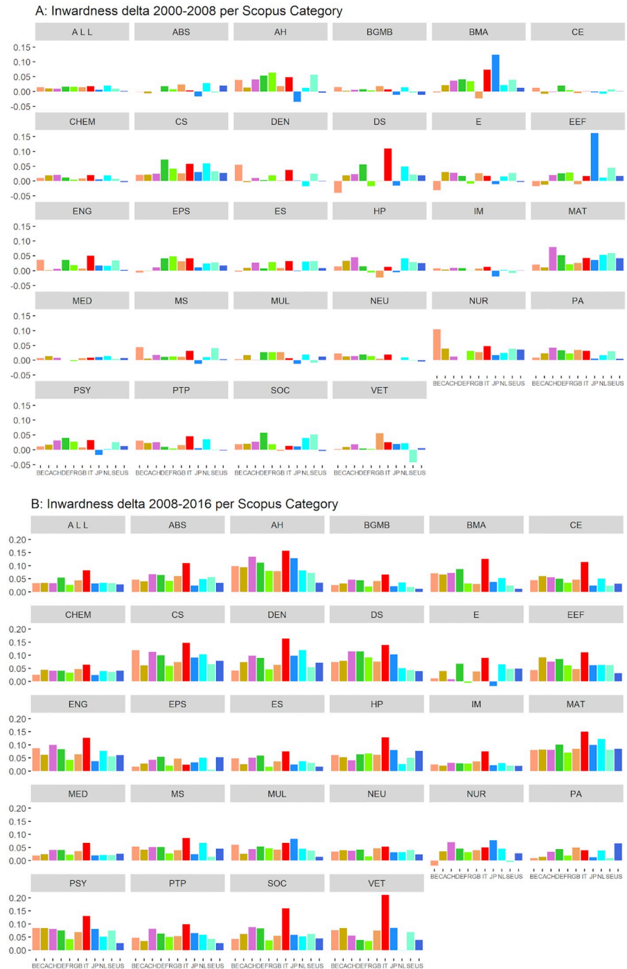
Fig 3. Inwardness delta in Scopus Main Categories in the periods 2000-2008 (A) and 2008-2016 (B). ABS = Agricultural and Biological Sciences, AH = Arts and Humanities, BGMB = Biochemistry, Genetics and Molecular Biology, BMA = Business, Management and Accounting, CE = Chemical Engineering, CHEM = Chemistry, CS = Computer Science, DEN = Dentistry, DS = Decision Sciences, E = Energy, EEF = Economics, Econometrics and Finance, ENG = Engineering, EPS = Earth and Planetary Sciences, ES = Environmental Science, HP = Health Professions, IM = Immunology and Microbiology, MAT = Mathematics, MED = Medicine, MS = Materials Science, MUL = Multidisciplinary, NEU = Neuroscience, NUR = Nursing, PA = Physics and Astronomy, PSY = Psychology, PTP = Pharmacology, Toxicology and Pharmaceuticals, SOC = Social Sciences, VET = Veterinary. Source: elaboration from SCIVAL data.

https://doi.org/10.1371/journal.pone.0221212.g003