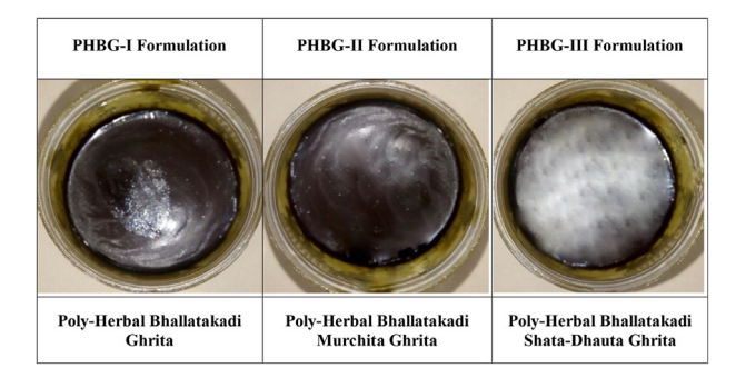
Fig. 1. - Prepared Poly-Herbal Bhallatakadi Ghrita (PHBG) formulations.

The 'Murcchana' samskara of ghee was carried out in a preliminary step and before 'Ghrita Paka Kalpana'. Murcchita ghee was prepared as per the procedure described in reference texts [7,10]. Briefly, initially specified amount of plain cow ghee (768 g) was melted in a vessel with moderate heating. Coarsely powdered Murcchana herbs; pericarp of fruits of haritaki (T. chebula Retz., Combretaceae, 48 g), amlaki (E. officinalis Gaertn., Euphorbiaceae, 48 g) and bibhitaki (T. bellirica Roxb., Combretaceae, 48 g); rhizomes of musta (C. rotundus Linn., Cyperaceae, 48 g), haridra (C. longa Linn., Zingiberaceae, 48 g) were mixed and was ground with matulunga swarasa (Citrus medica var. acidica, 48 g) to form a smooth paste (Kalka). The kalka was added to the molten ghee along with water (3.072 L) and boiled on slow fire till complete evaporation of water. It was further strained through muslin cloth and stored in a well closed container.