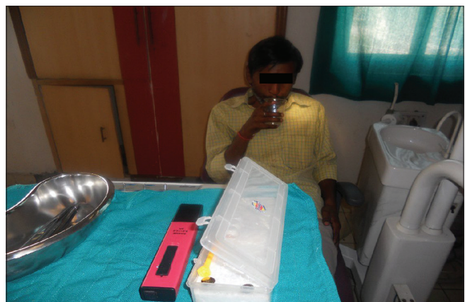
Figure 1: Saliva collection

The subjects in our study were present in the age group of 25–40 years. Group A and B subjects consume tobacco for minimum of around 5 years. The mean pH scores of saliva in three distinct groups showed that pH scores were maximum in the control group while it was least in tobacco chewers group [Figure 3, Table 1].