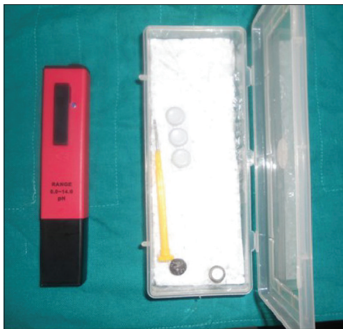
Figure 2: Salivary pH meter

When unpaired t -test was applied for comparison of pH scores of saliva between different groups, results showed a significant difference between pairs of groups at 0.05 level of significance, i.e. ( P < 0.05 ) [Table 2]. Hence, a significant relation was obtained when the mean salivary pH for groups were compared.