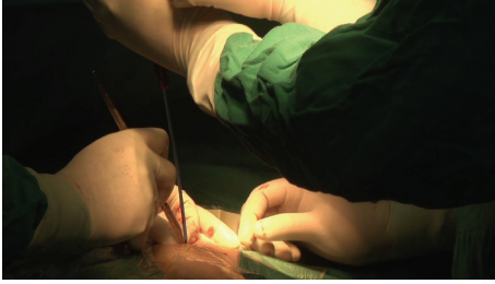
FIGURE 1: In the 4th intercostal space of the left sternal border, puncture directly through the right ventricular surface into the right ventricle with an 18 G needle, and then pass the guide wire into the left ventricle through the sheath.