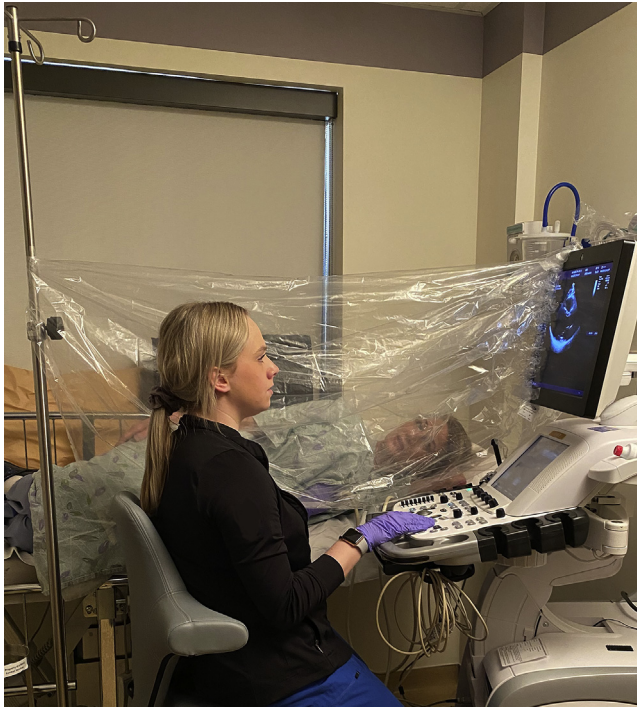
Figure 2 Barrier example used between the patient and the sonographer. 15-18 This is a posed photograph demonstrating the barrier technique and how the sonographer's arm can maneuver under the barrier shield. If this were a real situation, the sonographer would be wearing appropriate PPE.

ahead of time to identify the imaging goals in an effort to reduce examination time and exposure.