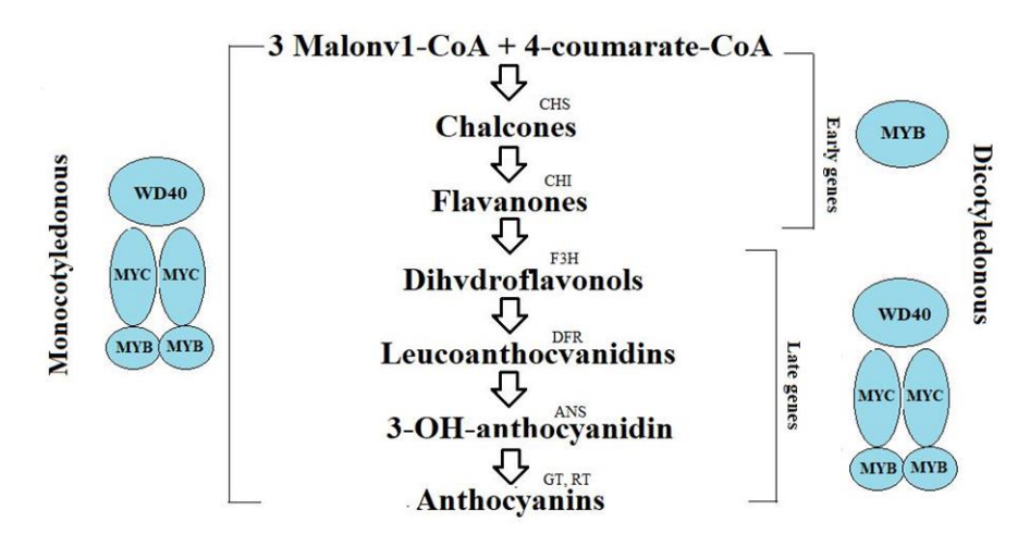
Figure 1. Biosynthesis of plant glycosides and its regulation in monocotyledonous and dicotyledonous plants [54].

Searching for and mapping structural and regulatory genes that control the pathways of biosynthesis and pigment accumulation remain a prioritized task. The main objects of research are representatives of the Poaceae Barnnhart family, widely cultivated in Russia and abroad. Among cereal grasses, the formation of flavonoids was studied in more detail in Hordeum L. [55–61], and Triticum L. [62,63], while in representatives of the genus Avena L. this aspect is still unexplored.