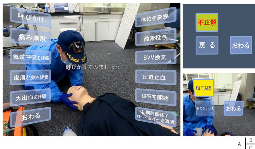
Fig. 1. Virtual reality content for learning Japan Prehospital Trauma Evaluation and Care initial assessment procedures. (A) A 360-degree video shows an injured person and an emergency medical service team member. The learner makes decisions as a team leader using the buttons. The buttons on the left, from top to bottom, are for calling response, pain stimulus, airway and respiratory assessment, skin and pulse assessment, bleeding assessment, and quitting the session. The buttons on the right, from top to bottom, are for changing position, oxygen administration, bag valve mask ventilation, compression hemostasis, cardiopulmonary resuscitation, and complete initial assessment. (B) Indications when a wrong selection is made. The incorrect selection is displayed in red letters on a yellow background. Two options are displayed in white letters on a blue background: “Try it again” and “Quit session.” (C) Indications when the initial selection is correct. The word “Clear” is displayed in blue letters on a yellow background. Two options are displayed in white letters on a blue background: “Try another scenario” and “Quit session.” If the first option is chosen, another scenario randomly appears.

The differences between groups were tested using the Friedman test and Bonferroni correction. Probability value of less than 0.05 was accepted as significant in the Friedman test, but probability values of less than 0.0167 by the Bonferroni correction regarding a comparison between two of