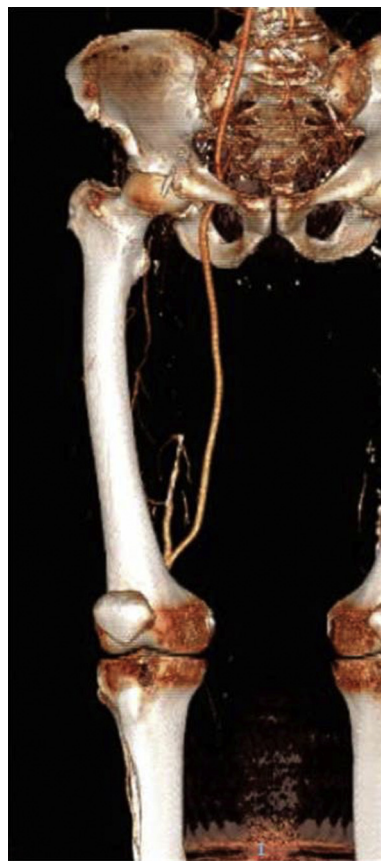
Fig. 2. Iliac-above-knee popliteal bypass through a transobturator approach.

ing of only one case we cannot claim a major affinity of this bacteria for biosynthetic materials.