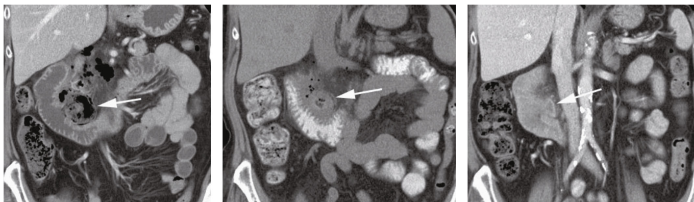
FIGURE 3: Duodenal diverticulitis. Axial CT scan shows inflamed diverticulum (arrow) medial to the duodenum (arrowheads). There was also free retroperitoneal air (not shown here).

regimens were composed according to local protocol at the time of treatment, and different regimens could be administered in different cases.