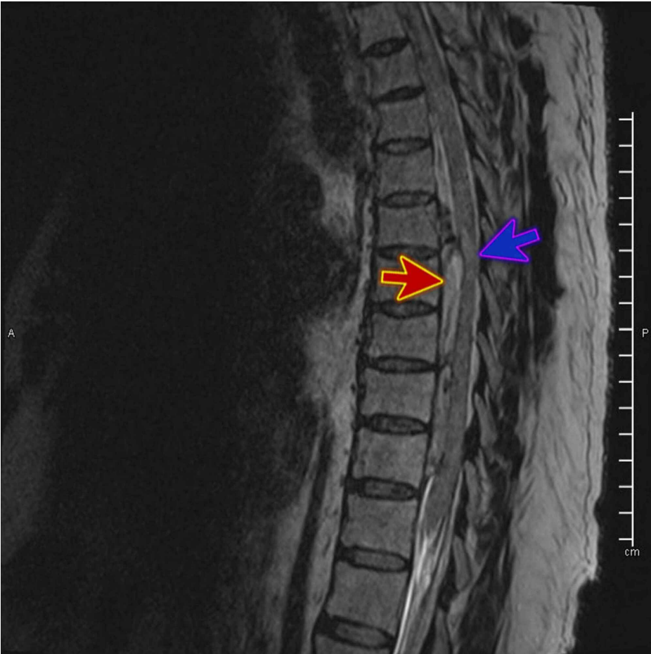
FIGURE 2: MRI T2WI sagittal view shows extensive extradural hematoma severe mass effect on the cord (red arrow) with evidence of edema (blue arrow), most severe at the level from the seventh to the tenth dorsal vertebra (D7-D10)

MRI: magnetic resonance imaging, T2WI: T2-weighted image.