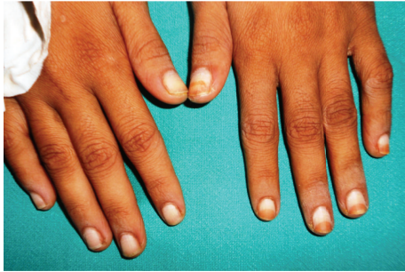
FIGURE 2: Total anolunula in a HIV-positive patient.

seen on the toes [2]. The size of lunula is variable not only among persons but also for each digit in the same person [5]. Lunula is most prominent on the thumb, becoming less prominent in a gradient towards the little finger [2]. Lunular size diminishes with age [5]. Recent studies have reported an increasing tendency of presence of lunulae of all fingers with age until 50–59 years old in males and till 40–49 years old group in females [4].