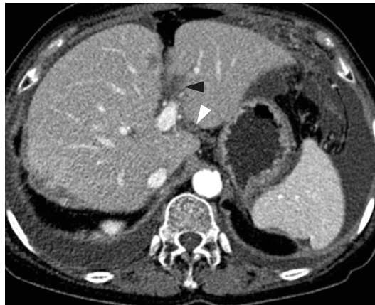
Fig. 7. Liver fissure metastases in a 66-year-old woman. Contrast-enhanced axial CT image shows two metastatic cancers in the major liver fissures. Black and white arrowheads indicates cancer foci in the fissures for ligamentum teres and venosum, respectively. CT, computed tomography.