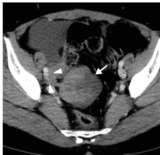
Fig. 2. Vascular invasion in a 48-year-woman. Contrast-enhanced axial CT image showing metastatic cancer (arrow) in the pelvic cavity. The smaller tumor (arrowheads) is encasing the right external iliac vessels, suggesting vascular invasion. A laterally-pointed arrowhead also indicates that peritoneum becomes thick by cancer spread. CT, computed tomography.