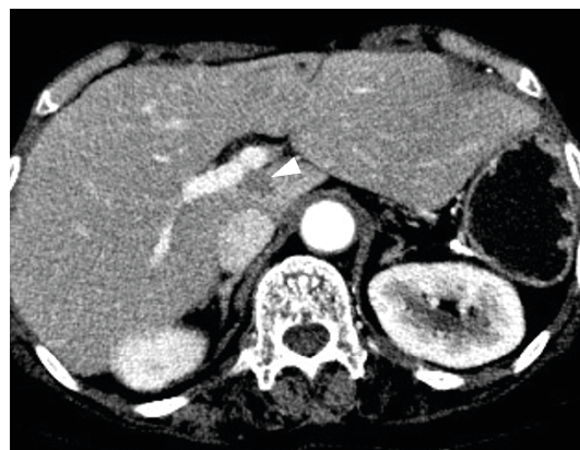
Fig. 6. Porta hepatis metastasis in a 61-year-old woman. Contrast-enhanced axial CT image shows a metastatic cancer (arrowhead) in the porta hepatis. The tumor is invading the caudate lobe of the liver. Because it was not surgically correctable, it was treated with percutaneous radiofrequency ablation. CT, computed tomography.