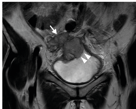
Fig. 3. Bladder invasion in a 48-year-old woman. T2-weighted coronal MRI showing a seeding cancer (arrow) invading the bladder dome in which the low signal intensity (arrowheads) of the wall is disrupted. MRI, magnetic resonance imaging.

Serosal deposits are difficult to detect on CT or MRI, particularly if bowel distention is inadequate. However, diffuse serosal infiltration, focal nodules, segmental mural thickening, and a well-defined mass are imaging features indicating the involvement of both the