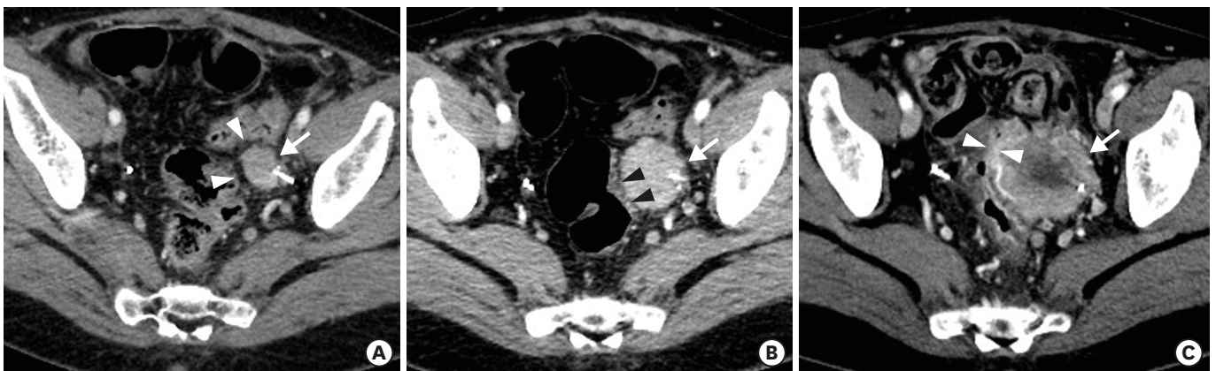
Fig. 1. Bowel adhesion and invasion in a 58-year-old woman. (A) Contrast-enhanced axial CT image shows recurrent ovarian cancer (arrow) in the sigmoid mesocolon. Arrowheads indicate a preserved fat plane between the tumor and the sigmoid colon. (B) A contrast-enhanced axial CT image taken 3 months later shows the fat plane (arrowheads) obliterated or hyperattenuating, suggesting tumor adhesion to the bowel. An arrow indicates the recurrent ovarian tumor. (C) A contrast-enhanced axial CT image taken 3 months later shows the tumor invading the muscular layer (arrowheads) of the sigmoid colon. An arrow indicates the recurrent ovarian tumor. CT, computed tomography.

A tumor projecting into the bowel lumen on CT images or MRI indicates mucosa involvement, and this is the most significant finding to diagnose bowel invasion. In cases