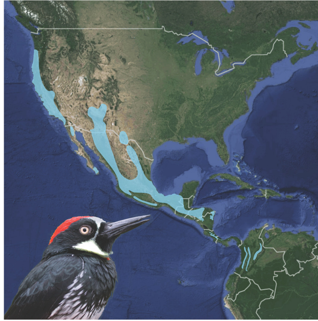
Fig 1. Geographic distribution of Acorn Woodpecker ( Melanerpes formicivorus ). An expert range map of Acorn Woodpecker from BirdLife International is shown in light blue. Inset shows a male Acorn Woodpecker (photograph by Walt Koenig). Reprinted under a CC BY license, with permission from Walt Koenig, original copyright 2011.