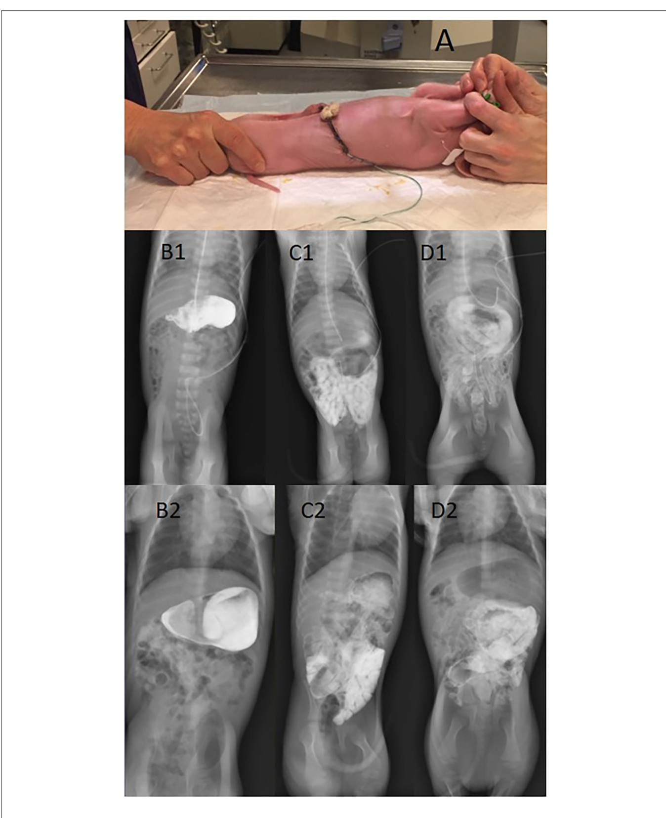
FIGURE 1 | Contrast X-ray imaging of preterm piglets placed in lateral recumbence for taking the X-ray picture (A). The figure also shows a stomach filled with contrast solution (B1, B2), contrast reaching the caecum (C1, C2), and contrast in colon and rectum with a near-empty small intestine (D1, D2). Upper panel: 4 days of age; lower panel: 18 days of age.