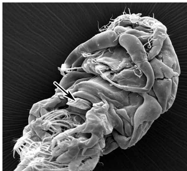
Figure 3. Prosome of Neoergasilus japonicus , ventral. Lake Grand Laouicien, France.

Among the most common food components in N. japonicus stomachs, were colonies of Cyanobacteria and diatoms that could be scraped off stones or other hard substrates. It is possible that the spade-like armament between the cephalosome and urosome with undefined functions, indicated with an arrow in Figure 3 is used by N. japonicus to scrape off the sedentary algae species from a hard substrate.