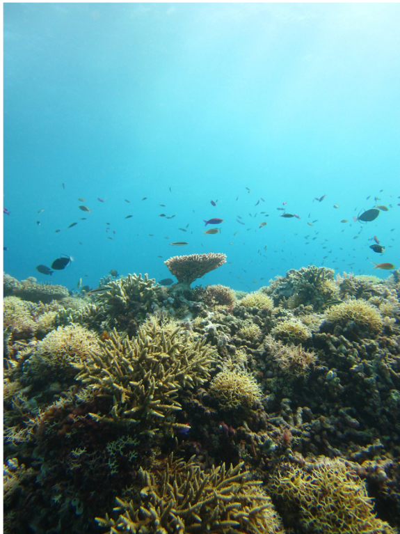
Figure 5 Winner: conservation ecology and biodiversity.

"The image was taken on a Catlin Seaview Survey expedition to Tubbataha Natural Park of the Philippine waters of the Sulu Sea in the heart of the Coral Triangle. A young, tabulate Acroporid coral can be seen reaching its branches toward the sun to fuel its Symbiodinium algal symbionts with a plethora of reef fishes in the background. It is the marine equivalent of a young tree shooting skyward to fulfil its ecological role in a forest. Corals, branching Acroporids especially, contribute greatly to habitat complexity, or rugosity, of reefs increasing the microhabitats for other reef creatures."