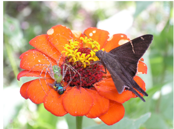
Figure 4 Winner: community, population and macroecology.

"A crab spider on a flower preying upon a euglossine bee, while a butterfly looks for nectar, taken on the slopes of Cerro Chucantí, Darién Province, in eastern Panama. Note, the bee had already filled his 'saddle bags' with pollen before being attacked by the spider. The petals on the far side of the flower also appear to be succumbing to some kind of blight, perhaps due to a fungus."