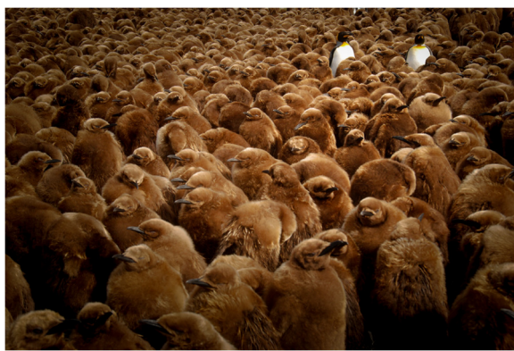
Figure 8 Winner: editor's pick. "King penguin chicks ( Aptenodytes patagonicus ) huddle together in huge crèches of several thousand chicks." Attribution: Laetitia Kernalleguen.

"As the center of marine biodiversity, there are over 350 species of coral and 500 species of fishes in Tubbataha. A young, tabulate Acroporid coral can be seen reaching its branches toward the sun to fuel its Symbiodinium algal symbionts with a plethora of reef fishes in the background. It is the marine equivalent of a young tree shooting skyward to fulfil its ecological role in a forest. Corals, branching Acroporids especially, contribute greatly to habitat complexity, or