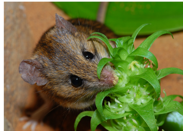
Figure 1 Overall winner. "A Namaqua rock mouse ( Aethomys namaquensis , Muridae) getting dusted with pollen of the Pagoda Lily ( Whiteheadia bifolia , Hyacinthaceae) while lapping nectar at the flowers."

At first glance, this image of a Namaqua rock mouse ( Aethomys namaquensis , Muridae) getting dusted with pollen of the Pagoda Lily ( Whiteheadia bifolia , Hyacinthaceae) might not appear to be particularly striking. But this is an image that is much more than it at first appears. In contrast to last year's winning image, of an evolutionary adaptation driven by the avoidance of death, this year's winner offers a fascinating window into a highly unusual evolutionary game in which mutual benefits aid the struggle for survival and reproduction. We tend to think of insects, and occasionally birds, when we think of pollination ecology, and this winning image therefore serves as a reminder of the variety of different ways in which nature