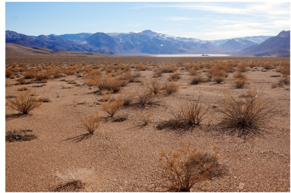
Figure 6 Winner: landscape ecology and ecosystems. "An endorheic basin in Death Valley, California. Although annual precipitation rarely exceeds 100 mm/yr, a small number of plants are able to survive on the gravelly slopes of the valley and on the muddy lakebed. Thousands of years ago this valley would have been far more wet and lushly vegetated."

This moment, the first report of a parasitoid attacking Camponotus morosus , or any Camponotus ant in Chile,