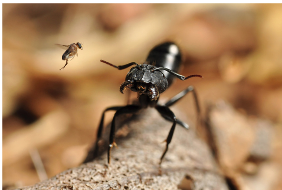
Figure 3 Winner: behavioural and physiological ecology. " Camponotus morosus ant being attacked by a parasitoid phorid fly (Diptera: Phoridae). At the moment of the attack the ants were involved in an intra-specific fight between two different ant nests and presumably the fly detected the ants because of the alarm pheromones released during the fight." Attribution: Bernardo Segura.