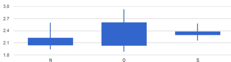
Figure 3. Example of statistics for zinc coordination spheres in the PDB. The information is accessible from the ‘Per metal’ statistics menu. (A) Pie chart displaying the coordination geometries of zinc sites; (B) histogram reporting the occurrence of residues in the first coordination sphere of zinc ions; (C) distances between zinc ions and different donor atoms.