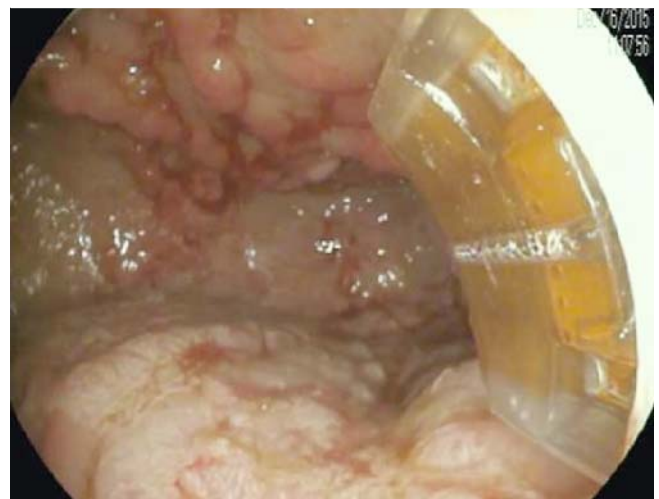
► Fig. 2 Application of treatment with RFA using Halo-90. The area from 4 to 7 o'clock shows treatment effect.

of this study, we do point out that currently, RFA catheters are considerably more expensive than those used for APC. At our institution in the United States, our current costs are $ 243.50 for the single-use APC catheter used in this study and $ 1222 for the HALO-90 catheter.