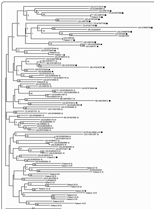
Figure 3 Neighbour-joining phylogenetic tree of HIV-1 subtype D V3 sequences from 26 patients and 72 sequences from GenBank. Patients are identified with the same number than in Figure 1 and the GenBank sequences are identified with the country (two letters code) and the accession number. The corresponding phenotype is indicated by symbols: open circles indicate sequences from R5 viruses, solid circles indicate sequences from R5X4 viruses and solid squares indicate sequences from X4 viruses. Percentage bootstrap values are indicated on branches have been calculated for 1000 replicates. The genetic relatedness of two different sequences is represented by the horizontal distance that separates them, with the length of the bar at the bottom denoting a sequence divergence of 0.10.

slightly improved the sensitivity for predicting CXCR4 usage compared to analysis of V3 alone [30]. However, we previously analyzed the V1 and V2 regions of subtype B viruses and found no criteria that improved the genotypic prediction [8]. For subtype D viruses, no genotypic determinant has been identified in the V1-V2 region that improves the performance of the genotypic approaches (data not shown). The determinants identified for predicting CXCR4 usage by subtype D viruses were combined in a simple genotypic rule that differed slightly from the combined rule validated for subtype B, C and CRF02-AG [10-12]. The concordance between the subtype D genotypic rule and the TTT (kappa coefficient: 0.70) was better than that for the subtype B tools (kappa coefficients: 0.15-0.40). The sensitivity of the subtype D genotypic rule (75%) was similar to that of the subtype B genotypic algorithms, applied to subtype B viruses to determine tropism (69 to 88%) [10].