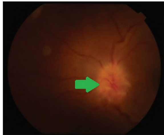
Figure 1: Fundus photography of left eye of the patient shows edematous disc with blurred margins (green arrow) and tortuous vessels, suggestive of optic neuritis

Since PON is a rare entity, there is no consensus on treatment, and it is based only on few published case reports. In general, immunosuppressive therapy is not very effective, and prompt treatment of the underlying malignancy seems to be the only way to halt disease progression. [7] However, since there is an