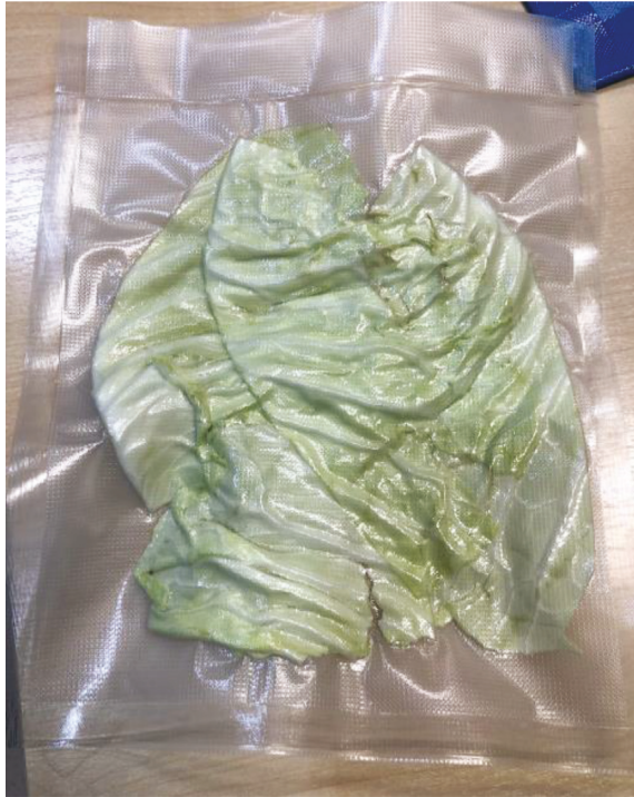
FIGURE 1: Cabbage leaves in a vacuum-sealed pack.

day, preferably after dinner or before sleeping. Each patient was advised to assess his or her pain intensity with the Oxford Knee Score before and after cabbage leaf application by utilizing an NRS. All patients of the control and experimental groups underwent a weekly follow-up to pick up vacuum-sealed cabbage leaves. At four weeks, the patients were assessing their pain using the NRS and clinical scores of OA knee with the Oxford Knee Score. If a patient undergoing cabbage leaf application showed worsening pain symptoms, the doctor advised standard treatment instead of cabbage leaf application [18]. If a patient was found to be allergic to the cabbage leaves, the doctor advised immediate cessation of the cabbage leaf application and medical attention at the nearest hospital as soon as possible. The patients were advised to watch for the following signs of allergy during cabbage leaf application: itchiness, urticaria, nausea, vomiting, diarrhea, acute dyspnea, and palpitations. All the patients completed the study successfully, and none of the patients were lost during the follow-up period (Figure 2). The patients were given the contact details of the research team and orthopedist team at Chulabhorn Hospital for referral in case of an emergency.