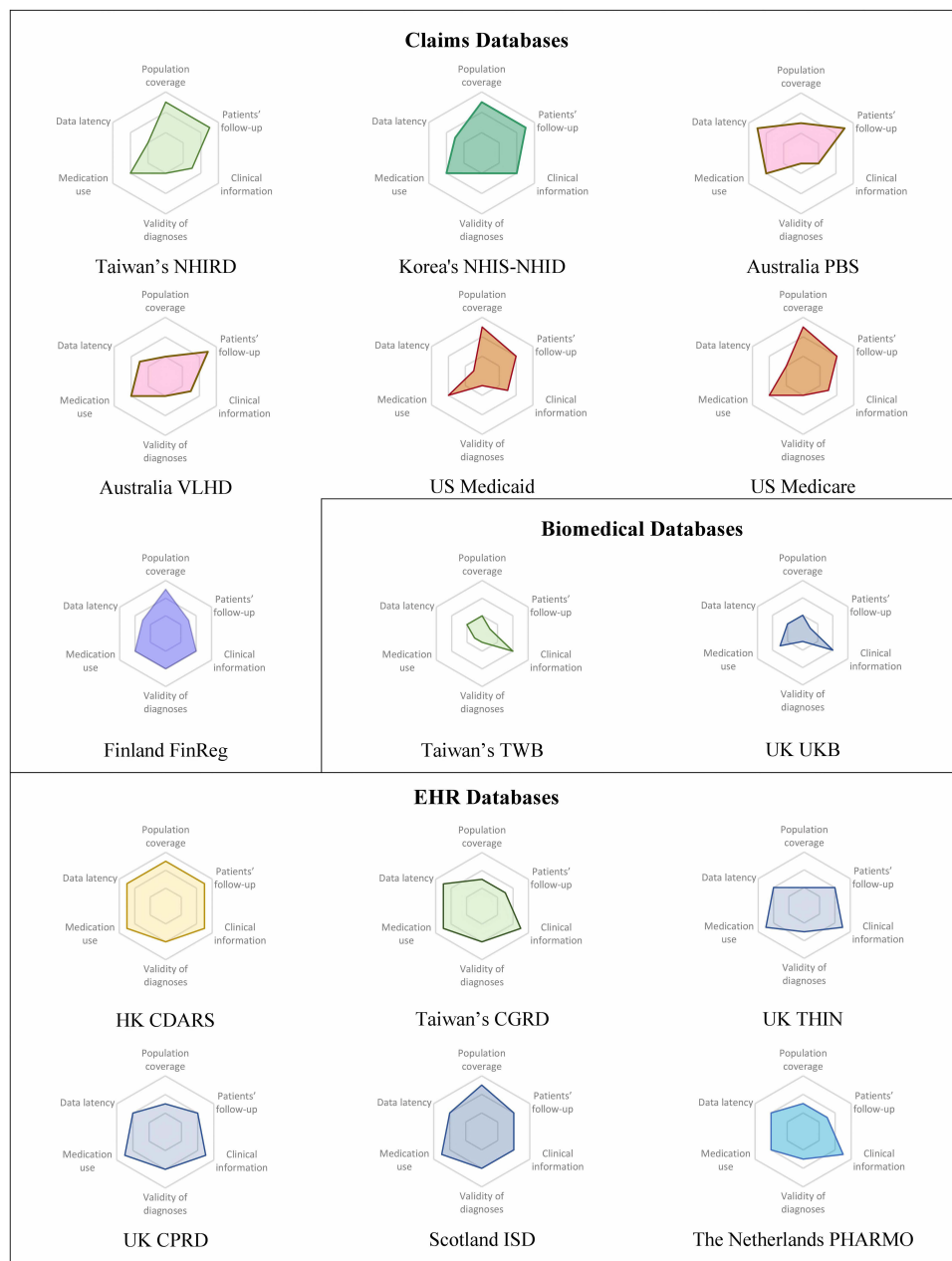
Figure 2 Database features.

and mental disorders. This will also serve to raise public awareness of neurological and mental illness research to further facilitate treatment and non-pharmacological intervention.