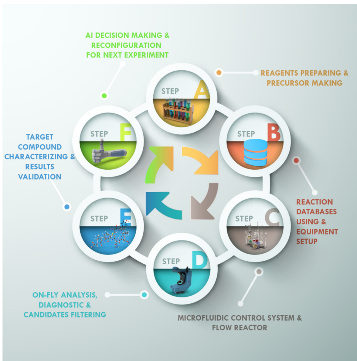
Figure 4. Fully automated closed-loop self-driving laboratory.

If a mobile robot in the chemical lab is combined with AI technologies, the resulting self-driving lab could solve rather challenging complex tasks, including the search for the optimal photocatalytic system within the process of hydrogen production from water. It was shown that such a system could operate completely autonomously for several days and the scientific results were equivalent to those produced by the human researcher, who should use several months of efforts for such a study to fully explore five hypotheses under the study in the same level of detail using standard manual approaches [54]. The autonomous robot used in the research also requires half a day to set it up initially, but it then runs unattended over multiple days (1000 experiments take only 0.5 days for the robot, while a manual hydrogen evolution measurement requires about 0.5 days of researcher time per single experiment). Hence, the autonomous workflow is 1000 times faster than manual methods and at least 10 times faster than semi-automated but non-autonomous robotic workflows [54].