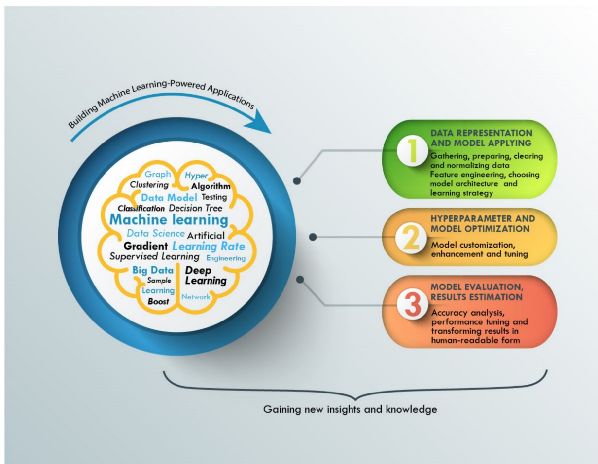
Figure 2. Machine learning powered problem-solving process.