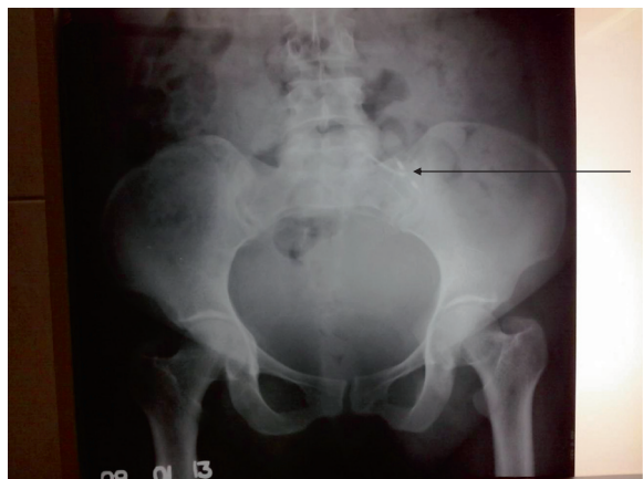
Figure 1 Anteroposterior X-ray of pelvis showing the intrauterine device (arrowed).