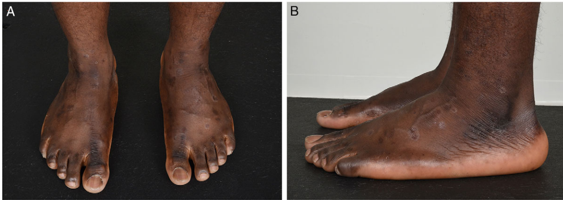
Figure 1: Anterior–posterior (A) and lateral views (B) of both feet. No obvious abnormalities were detected on general inspection.