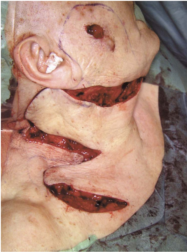
Figure 4 Intraoperative view after conservative neck dissection and prior to tumour removal, parotidectomy and placing of the local bi-lobed flap. The safety margin is well marked around the tumour and the preparation of the flap is completed.