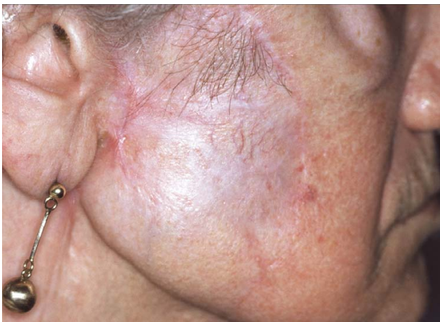
Figure 5 Six months postoperatively with full cosmetic and functional recovery.

since all neoplasms previously regarded as sarcomas of uncertain origin are now included in this category [2]. MFH typically arises in the soft tissues of the extremities and retroperitoneum, the head and neck region is seldom involved. In superficial sites such as the skin, MFH may behave in a benign fashion despite high-grade looking and fast growing tumour cells.