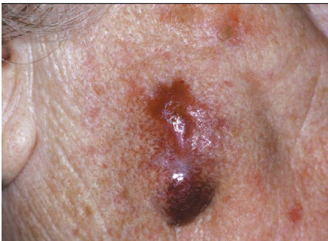
Figure 1 Preoperative view of the lesion on the right cheek: a smooth, firm nodule with wide erythematous border.

An eighty-seven year old woman was referred to our department because of a fast-growing, dark-brownish, indurated skin nodule sized 3 cm in diameter, which infiltrated the skin and the deeper soft tissue layers of the face (Fig 1.) Four months beforehand, a benign cutaneous histiocytoma (BFH) had been removed from the same location by excision biopsy (Fig. 2a–d), which had been a painless, slow-growing, brownish lump not exceeding 1 cm in diameter clinically. Surgical margins had been disease-free.