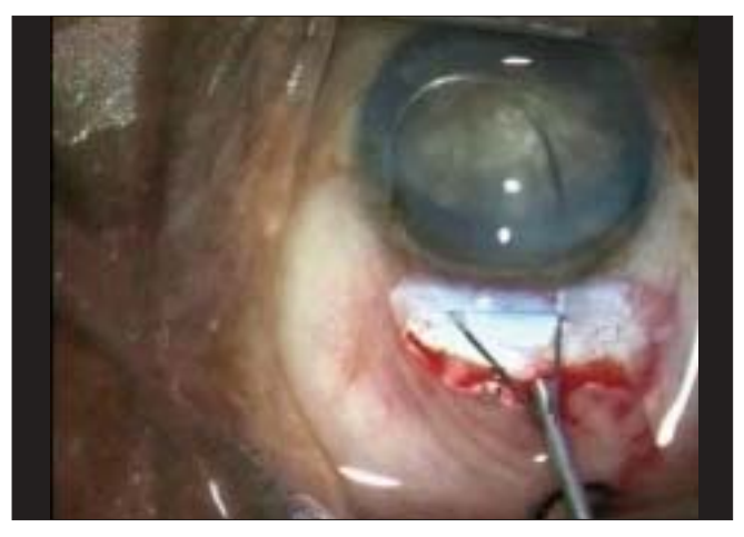
Figure 1: Negotiation of the snare into the anterior chamber