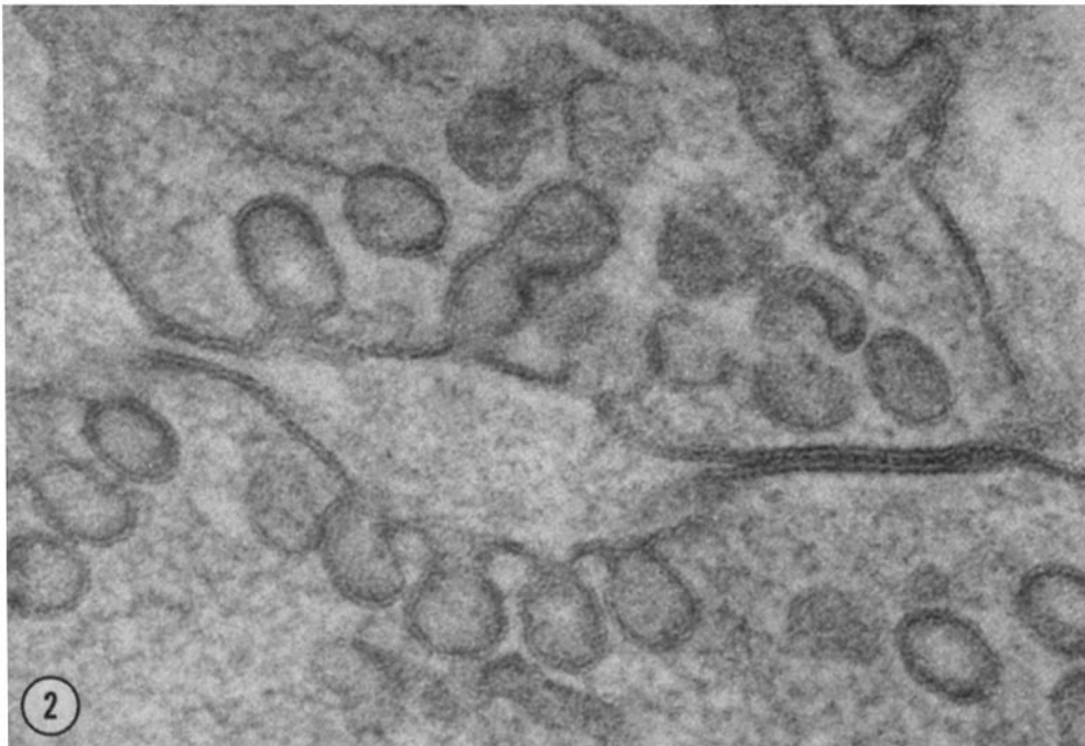
FIGURE 1 Irregularly shaped smooth muscle cells of the human aortic arch. Close apposition is observed between small areas of adjacent cells (arrow), while the other parts are separated by large areas of the extracellular matrix. Some smooth muscle cells contain electron-opaque bodies. \times 6500 .