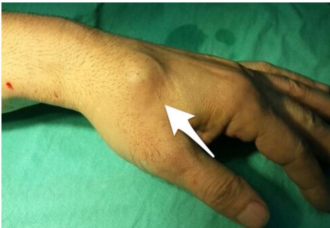
FIGURE 1. A mass at the snuff box area of the left hand.