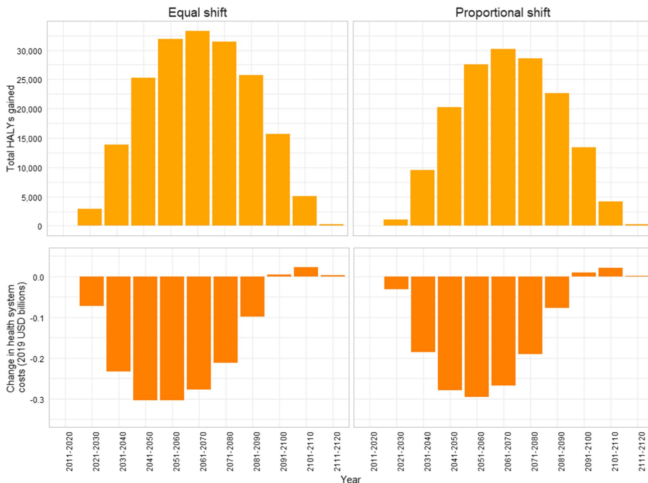
Fig. 3 Health gains and change in the healthcare system costs over time under modelled scenarios