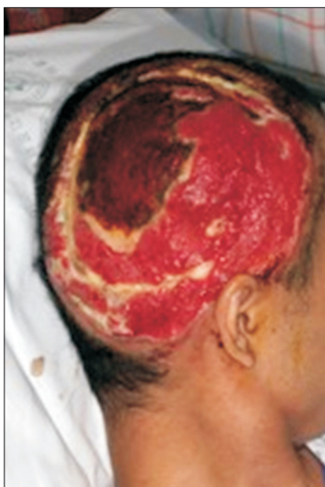
Fig. 1. A third-degree burn on the right scalp of the patient, and skull necrosis.

While working on electrical wiring, a 33-year-old male fell from a height of 1.5 m after receiving a 10,000-V electrical shock from a high-voltage power line. The patient had third-degree burns on his left arm and right scalp (Fig. 1). Because of the burn and the presence of compartment syndrome, the left arm was amputated below the elbow; later, due to the development of necrosis on the stump, an additional amputation above the elbow was done. To treat the right scalp injury, debridement of dehiscence and skull necrosis was performed, followed by flap surgery. The patient had neurologic deficits manifesting as spasticity, motor weakness, and sensory impairment below thoracic level 11. According to the International Standards for Neurological Classification of Spinal Cord Injury (ISNCSCI) scoring system, the total