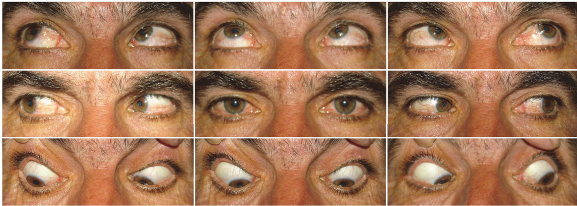
FIGURE 2: Nine cardinal photographs of patient number 3 after botulinum toxin injection.

alignment in all patients described to date [5]. The patients in this series represent this group. Type 3 AACE (Bielschowsky type) is characterized by acute onset of esotropia in patients with uncorrected myopia of -5.00 diopters or more, presumably following physical or mental stress [24]; subsequent reports have emphasized that good binocular function can be maintained in these patients with prisms [5].