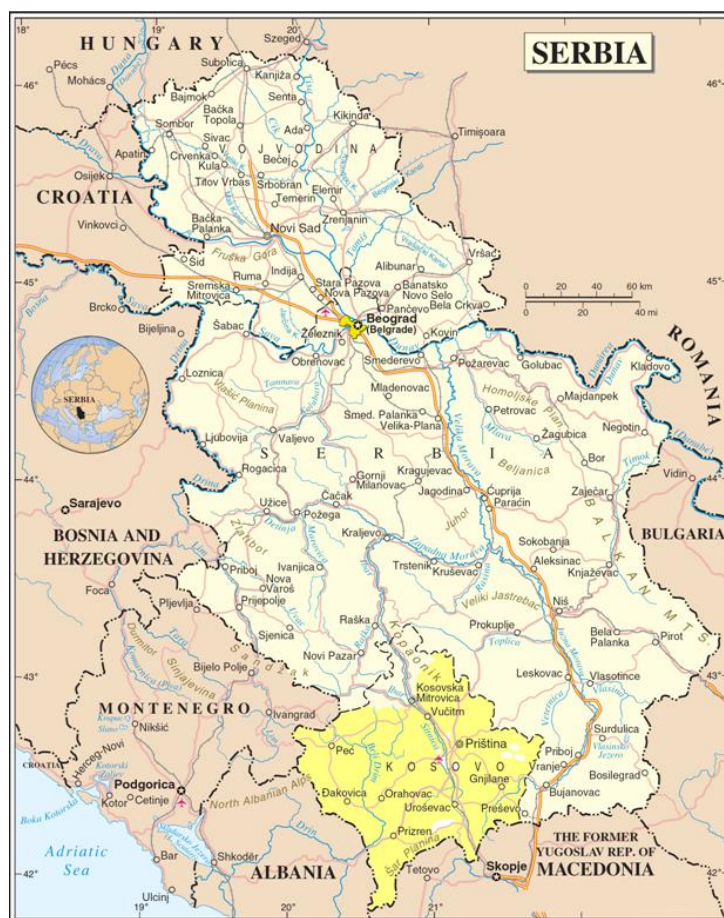
Fig. 1: Map of sampling area - Encircled part of the map

(42°43'00"N 24°55'04"E). This is the highest mountain in South-East Serbia. Stara Planina (Balkan mountain) is the Southern Karpathian fold stretching for 560 km from Vlashka Chuka Peak fist to the North on the border between Serbia and Bulgaria and then folding East through Central Bulgaria to Cape Emine on the Black Sea, thus framing the Pannonian Basin on the South of the Danube (Fig. 1). Stara Planina has a characteristic climate changing from moderate continental, mountain (Alpine) and on the high peaks subarctic. Going from low to higher slopes, the average temperature drops while humidity increases. With an average temperature of 0.5 °C, the coldest month is Jan, while July with 22 °C is the warmest. Average annual rainfall is 960.5 mm.