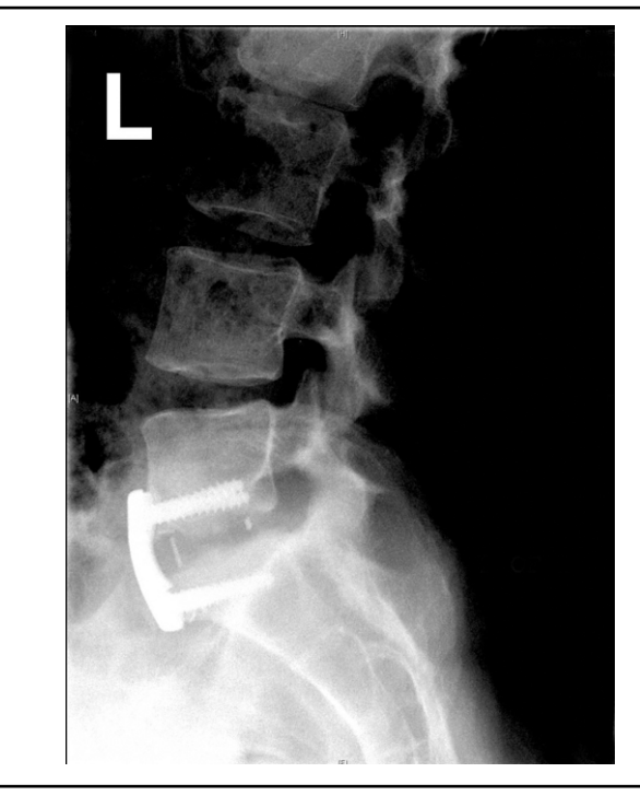
Postoperative lateral (Case 2).

returned to work and has had persistent chronic lower back pain since. Over the course of his treatment, he underwent multiple courses of physical therapy, epidural injections, and has chronically been on narcotic analgesics (Vicodin). He worked since the time of his injury as a carpenter until about 1 year prior to evaluation, but has had intermittent exacerbations of his back pain, which have in the past caused him to miss work for several weeks at a time. One year prior to evaluation, he again sustained an exacerbation of his back pain while at work and had been unable to return to work since.