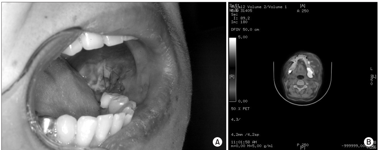
Fig. 2. Figures of Case 2. A. Pre-radiotherapy intraoral clinical photo. B. Pre-radiotherapy positron emission tomography image. Note the hot spots on the left side.

Ki-Uk Nam et al: Occurrence of multiple myeloma in the head and neck: a report of two cases. J Korean Assoc Oral Maxillofac Surg 2013