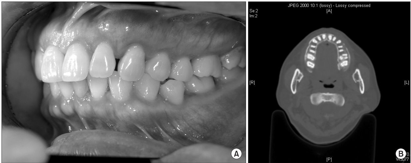
Fig. 1. Figures of Case 1. A. Intraoral clinical photo. Reddish swelling was seen with the #22 and 23 teeth. B. Computed tomography image. The left maxilla cortical bone disappeared.

Ki-Uk Nam et al: Occurrence of multiple myeloma in the head and neck: a report of two cases. J Korean Assoc Oral Maxillofac Surg 2013