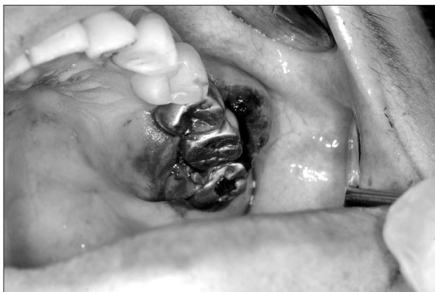
Fig. 4. Figure of Case 2. Recurring multiple myeloma. Ki-Uk Nam et al: Occurrence of multiple myeloma in the head and neck: a report of two cases. J Korean Assoc Oral Maxillofac Surg 2013

performed again, with the patient hospitalized after consulting the Department of Hematology and Oncology for observation with chemotherapy (dexamethasone, thalidomide, cyclophosphamide, doxorubicin, cisplatin, and etoposide). Note, however, that cytopenia, azotemia, and pleural effusion of the lungs were observed due to development of the lesions; the patient was discharged in September 2011 due to the aggravation of general condition owing to the lesions.