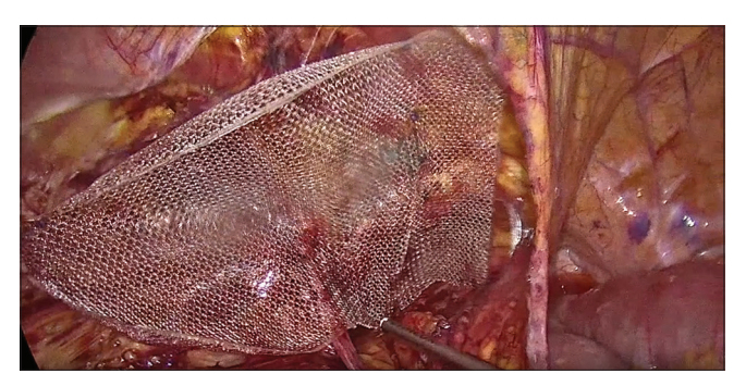
Video 1: This video vignette showcases a 74-year-old female with symptoms suggesting bowel obstruction due to a strangulated left obturator hernia. It further comprehensively explores the clinical presentation, diagnosis, and management of obturator hernias in general.

However, the potential advantages of laparoscopy must be weighed against its limitations. In cases of late presentation,