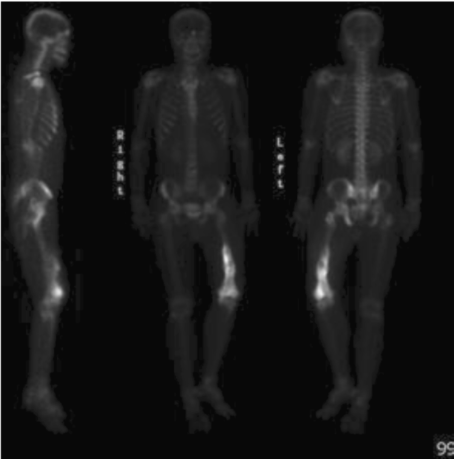
Figure 3 Bone scan showing isolated uptake of the left mid and distal femur.