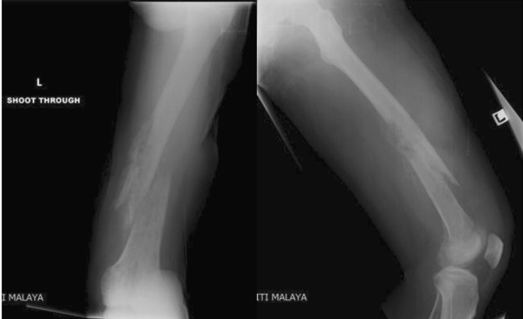
Figure 4 Radiograph demonstrating pathological fracture of the distal third of the left femur with shortening.