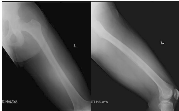
Figure 1 Plain radiograph shows destruction of the posterior medial cortex of the mid-shaft of left femur with periosteal reaction associated with a soft tissue shadow.

diagnosis of osteosarcoma was made based on the radiological findings.